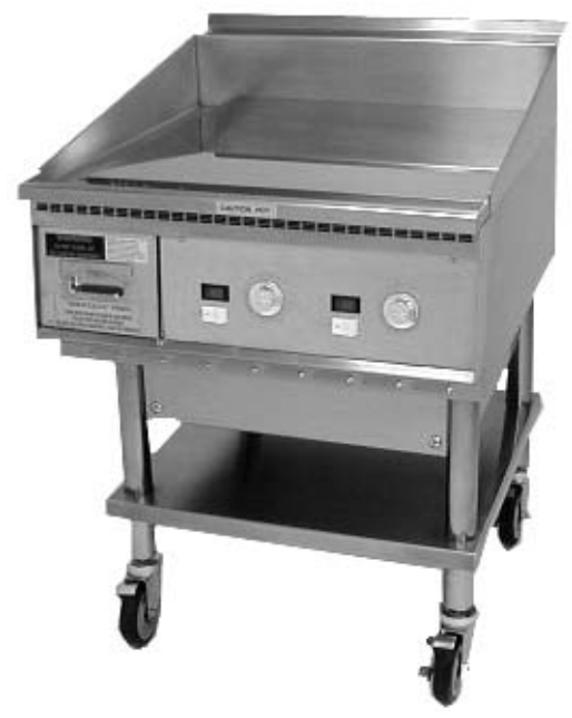
*Stand with casters or 4" legs are optional

The smooth surface of the MIRACLEAN® prevents food particles from being trapped as they are in steel plate griddles. The surface virtually eliminates flavor transfer.