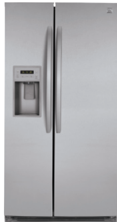
Kenmore 26.5 cu. ft. Side-by-Side Refrigerator