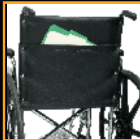
Chart pocket is included on 2000 and 2000HD models.

Dual axle allows seat to be easily lowered to hemi height. Available on 2000, 3000 and 4000 models.