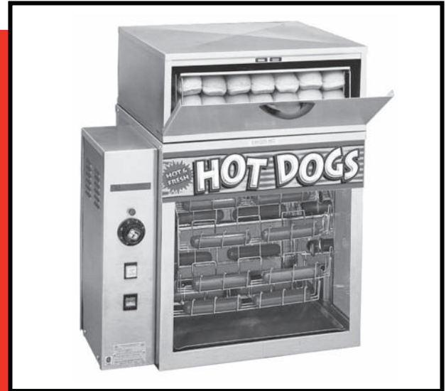
MODEL DR-2A HOT DOG BROILER WITH OPTIONAL BH 1A BUN HOLDER

* Please note: DR-1A and BH-1A are listed with UL, NSF and CSA as individual components only, not as the DR-2A package.