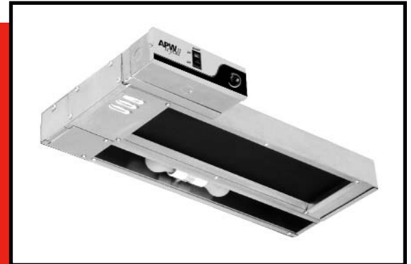
RADIANT*BLACK™ LIGHTED SINGLE OVERHEAD