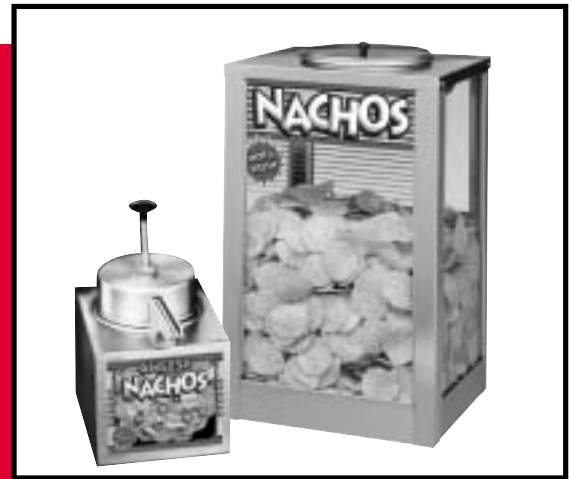
Nacho Cheese Pump with Nacho Cabinet