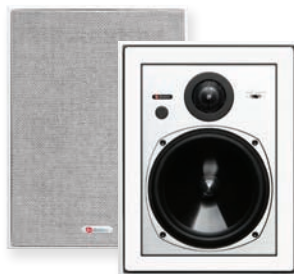
VSi 575 2-Way 6½" In-Wall Speaker