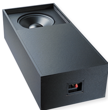
Sub10F 10" In-Floor Subwoofer