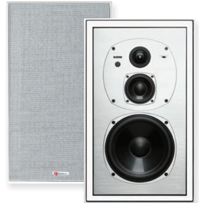
VSi 5835 3-Way 8" In-Wall Speaker