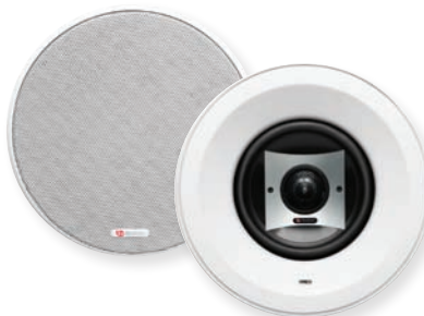
VSi 570 2-Way 6½" In-Ceiling Speaker