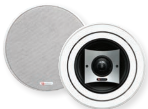
VSi 560 2-Way 6" In-Ceiling Speaker (6" driver in a 5¼" cutout)