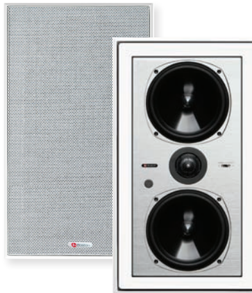
VSi 555W2 2-Way Dual 5 1/4" In-Wall Speaker