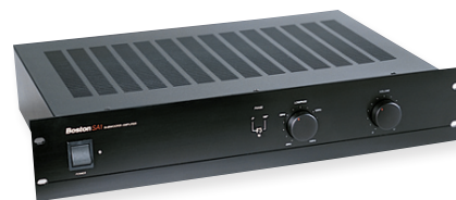
SA1 210-Watt Subwoofer Amplifier