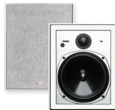
VSi 585 2-Way 8" In-Wall Speaker