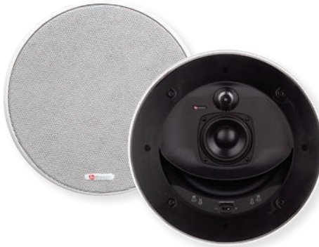
VSi 5830 3-Way 8" In-Ceiling Speaker