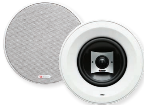
VSi 580 2-Way 8" In-Ceiling Speaker