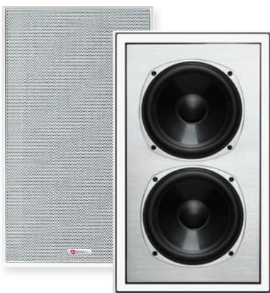
VSi S8W2 Dual 8" In-Wall Subwoofer