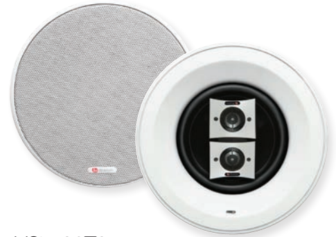
VSi 580T2 8" Stereo In-Ceiling Speaker