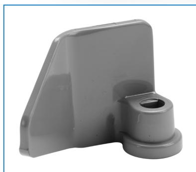
Standard kneading blade

It is important that the bread pan is securely inserted into the base of the baking chamber to enable the kneading blade to operate correctly. This is achieved by placing the bread pan into the baking chamber and pushing down firmly until the pan is in position. (Refer to page 13, step 4).