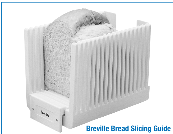
Breville Bread Slicing Guide

Breville recommends using the Breville Bread Slicing Guide - Model BS1. This foldable, lightweight cutting guide is the ideal accessory for any bread maker. The guide slots ensure straight, even slices every time when using a bread knife or electric knife.