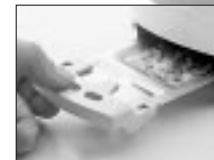
Removable slide out crumb tray