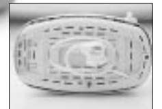
Tidy cord storage