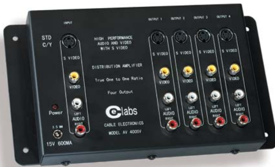
AV400SV Composite Video/Audio/S-Video Distribution Amplifier

High quality amplifier allows for multiple signal distribution equal to source signal output with no signal loss.