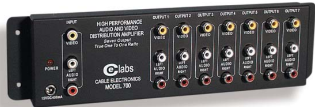
AV400 & AV700 Composite Video/Audio Distribution Amplifiers