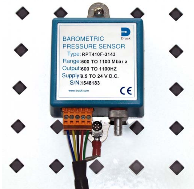
FIGURE 3-1. Mounting CS115

The mounting holes for the sensor are one-inch-centered, and will mount directly onto the holes on the backplates of the Campbell Scientific enclosures. Mount the sensor with the pneumatic connector pointing vertically downwards to prevent condensation collecting in the pressure cavity, and also to ensure that water cannot enter the sensor.