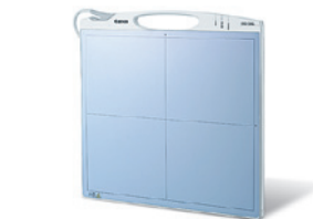
CXDI-501G Multipurpose Portable Digital Flat-Panel Detector

The detector features a pixel pitch of 125 microns on an approximate 16.8" x 16.3" imaging area, allowing higher resolution quality, higher sensitivity, and higher signal to noise ratio.