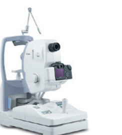
CR-2 Digital Non-Mydriatic Retinal Camera

The industry's lightest wireless detector, weighing only 7.5 lbs., offers a high level of flexibility, increased workflow efficiency and ease of use, all with a low dose to patients.