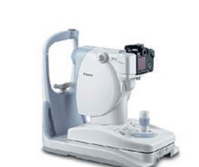
CR-2 Digital Non-Mydriatic Retinal Camera

The lightweight and compact detector offers exceptional digital radiographic imagery, large area detection, and a detachable cable for time-effective transport and simple installation.