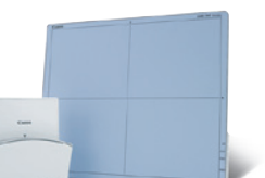
CXDI-70C Wireless Premium Flat-Panel Detector

The industry's lightest wireless detector, weighing only 7.5 lbs., offers a high level of flexibility, increased workflow efficiency and ease of use, all with a low dose to patients.