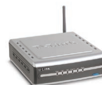
DSM-G600 Wireless Network Storage Enclosure