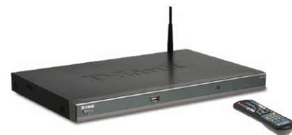
DSM-520 Wireless HD Media Player

Other D-Link products that work with the DSM-520: