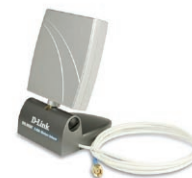
DWL-M60AT Directional Indoor Antenna