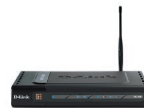
DGL-4300 Wireless 108G Gaming Router

Other D-Link products that work with the DSM-520: