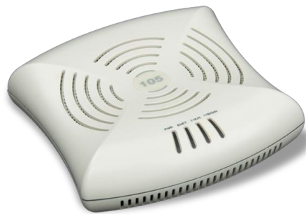
Figure 3 - AP-105 Wireless Access Point

The Aruba AP-105 is high-performance 802.11n (2x2:2) MIMO, dual-radio (concurrent 802.11a/n + b/g/n) indoor wireless access points capable of delivering combined wireless data rates of up to 600Mbps. This multi-function access point provides wireless LAN access, air monitoring, and wireless intrusion detection and prevention over the 2.4GHz and 5GHz RF spectrum. The access point works in conjunction with Aruba Mobility Controllers to deliver high-speed, secure user-centric network services in education, enterprise, finance, government, healthcare, and retail applications.