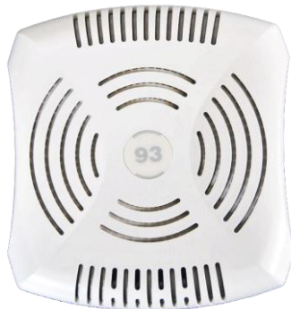
Figure 2 - AP-93 Wireless Access Point

The Aruba AP-93 is robust-performance 802.11n (2x2:2) MIMO, single radio supporting 2.4 GHz or 5 GHz (802.11a/ b/g/n), indoor wireless access points capable of delivering wireless data rates of up to 300Mbps. This multi-function access point provides wireless LAN access, air monitoring, and wireless intrusion detection and prevention. The access point works in conjunction with Aruba Mobility Controllers to deliver high-speed, secure user-centric network services in education, enterprise, finance, government, healthcare, and retail applications.