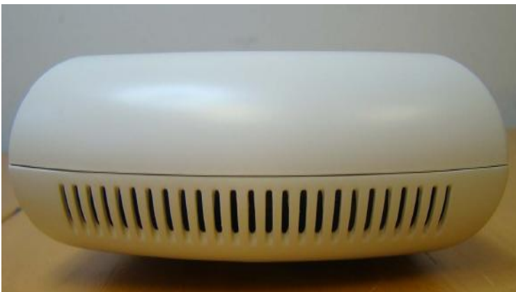
Figure 15 - Aruba AP-105 Tel placement front view

Following is the TEL placement for the AP-105: