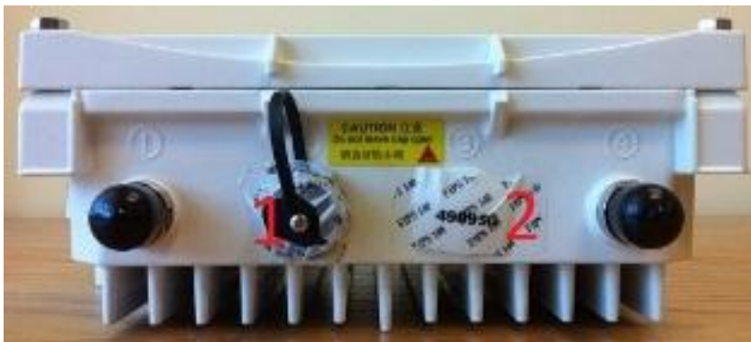
Figure 19 - Aruba AP-175 Tel placement front view

Following is the TEL placement for the AP-175: