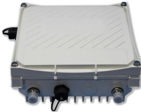
Figure 4 - AP-175 Wireless Access Point

The Aruba AP-175 is high-performance 802.11n (2x2:2) MIMO, dual-radio (concurrent 802.11a/n + b/g/n) indoor wireless access points capable of delivering combined wireless data rates of up to 600Mbps. This multi-function access point provides wireless LAN access, air monitoring, and wireless intrusion detection and prevention over the 2.4GHz and 5GHz RF spectrum. The multifunction AP-175 is an affordable, fully hardened outdoor 802.11n access point (AP) that provides maximum deployment flexibility in high-density campuses, storage yards, warehouses, container/transportation facilities, extreme industrial production areas and other harsh environments.