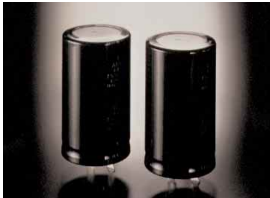
High current, high voltage, low ESR storage capacitors

Advanced technology that was developed for the DENON PMA-S1 integrated amp has been used in the rectifier circuit of the PMA-2000R. A large rectifier bridge with superior ability to supply high current and a first recovery diode with dramatically accelerated operating speed have been connected in parallel so that the PMA-2000R can accommodate both high speed and high current, to ensure true low impedance drive capability.