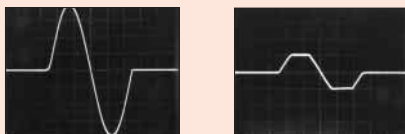
UHC single push-pull BJT single push-pull