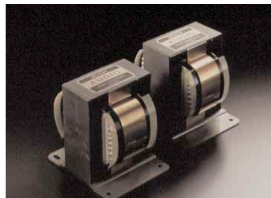
Leakage cancelling (L.C.) mounted dual power transformers