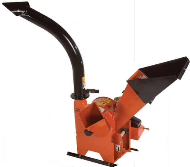
Shown here is the 5" PTO Chipper/Shredder/Blower - Model SC5540B (73554)