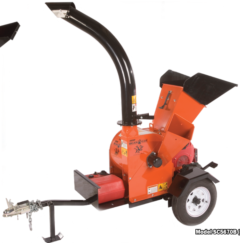
Model SC5670B (75524)

Easy access to rotor, blades and knives is provided by the large hinged cover with safety interlock.