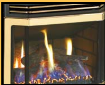
Shown with optional gold door crown and gold rod grille

The TrueGlow Burner, an exclusive from Quadra-Fire, sets a new standard for realism. The ceramic burner is molded from real wood pieces and coals. Flames rise from gas ports distributed throughout the glowing coal bed and lower logs, producing an incredibly active and varied fire. No need to hide the burner anymore—the TrueGlow burner proudly takes center stage, with an appearance that is phenomenal, whether it's burning or not.