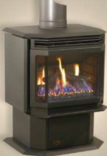
Shown standard black

An ordinary room becomes an inviting living space with the Columbia Bay from Quadra-Fire. Bay window styling, with your choice of black, gold or satin-nickel trim, adds just the right touch of class. Curl up in front of the fire and let the warmth and glow melt away the hassles of the day. High efficiency and great performance keep your heating bills down. And for even more convenience, add a thermostatic remote control.